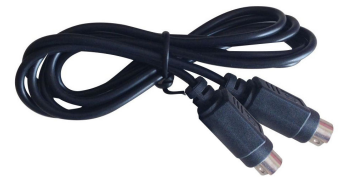
WFLY data cable