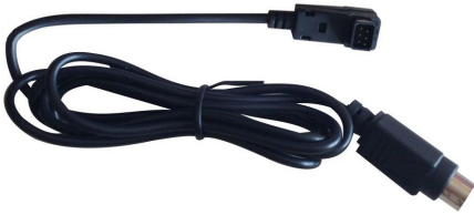
Futaba data cable