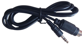
JR data cable