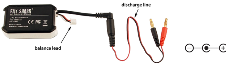
Connection to Standard RC Chargers

Note (2): If battery becomes fully discharged or accidentally shorted, an internal safety circuit will trip. To reset the battery, tap 9V direct to the barrel connector via the discharge adapter cable's banana connector (black = GND, red = 9V). This will instantly reset the battery and it can be recharged as normal.