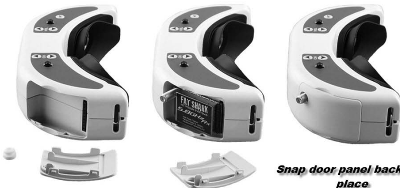
Remove door panel Remove hole plug