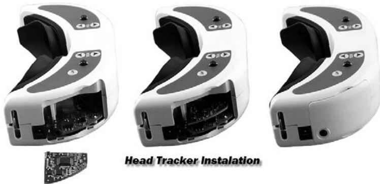
Head Tracker Instalation

Refer to head tracker module manual for up to date and detailed menu setup instructions. For individual radio setup instructions please visit our head tracking support forum at www.FPVlab.com Forum: Sponsors Gate/Fat Shark/Head tracker radio support.